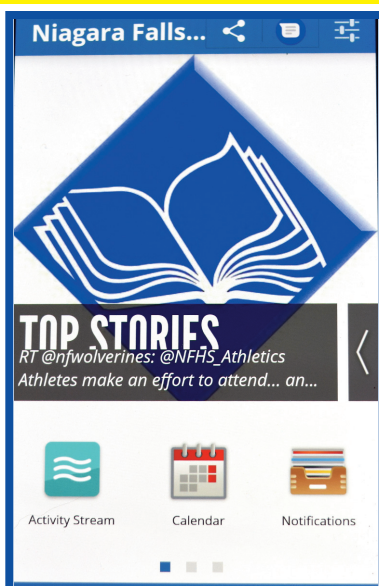
Download our District app today!

Peachjar: The District has contracted with Peachjar, which provides a virtual repository for flyers. Sign up with Peachjar for free to receive your school and District flyers. Stop sticking your head in that bookbag looking for stray pieces of paper! More environmentally friendly and more convenient, you can also access Peachjar flyers on our website or app.