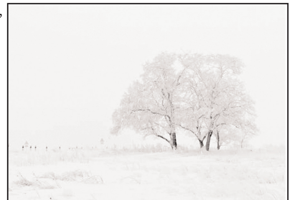
It's coming. We know it's coming.

share your email, so you can receive information